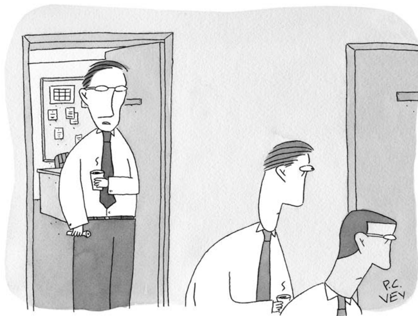
"The kazoo isn't the only instrument I play."